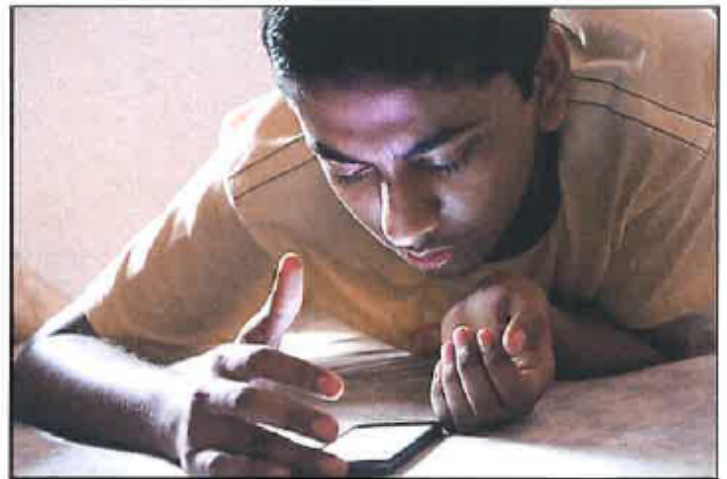
"Smartphone Teen"